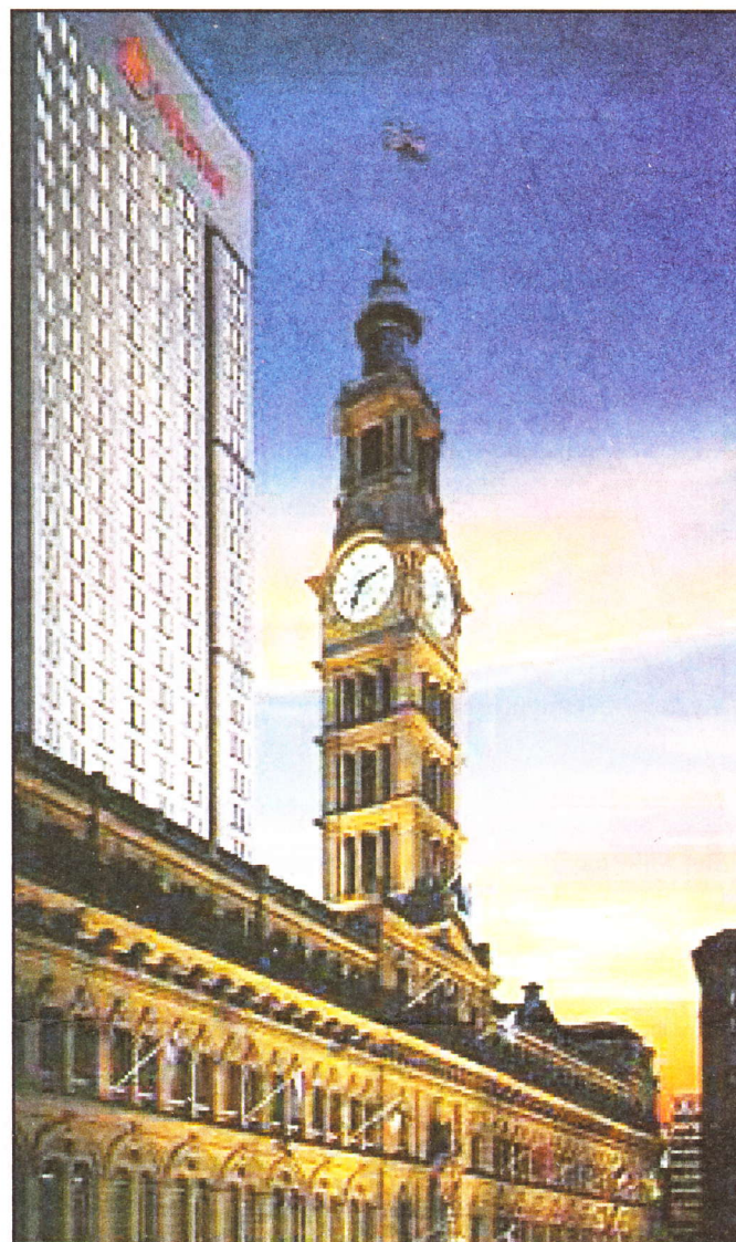
Presidential Suite in the Westin Sydney Hotel, one of the prize opportunities on the web.

"The lottos forum is one big community. Despite the anonymity a nickname and hundreds of kilometres afford, everyone is friendly and helpful. For example there is no Action supermarket near where I live, but I heard that the chain was holding a